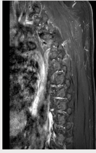
Sagittal thoracic MRI with contrast, pre (left) and post-op (right).

made four small incisions between the ribs, and then we could dock the robot. We identified the tumor at the top of the chest, where we expected, and opened the lining around it, called the pleura, which allowed us access to that part of the posterior mediastinum.