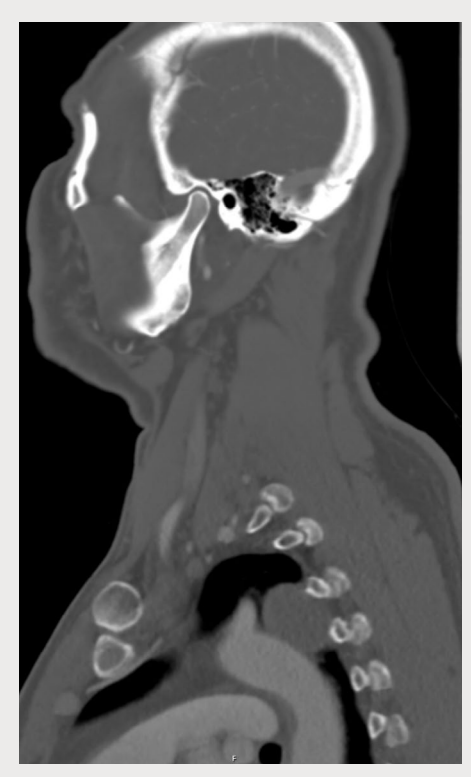
The original CTA taken in the ER to look for signs of a stroke and finding thoracic tumor.

Suspecting a stroke, the doctors performed a CT angiography of the patient's head and neck, in search of narrowed or blocked blood vessels that would indicate he was having a stroke, but found none. Instead it revealed an unrelated 4-centimeter mass in front of the spine, behind the aorta, in close proximity to major vascular and neurological structures. An MRI of the brain and other diagnostic imaging also showed no signs of a stroke.