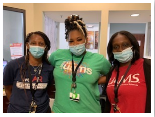
UAMS FAMILY MEDICAL CENTER, TEXARKANA